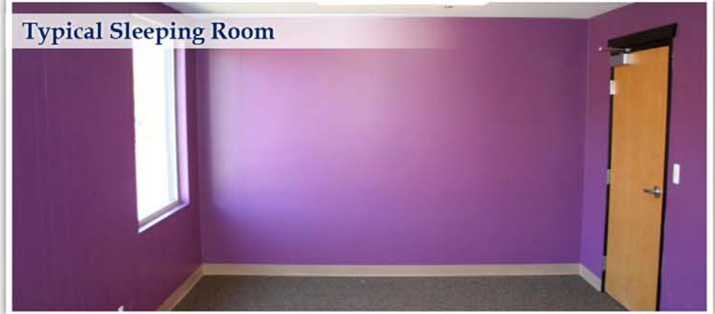
Typical Sleeping Room