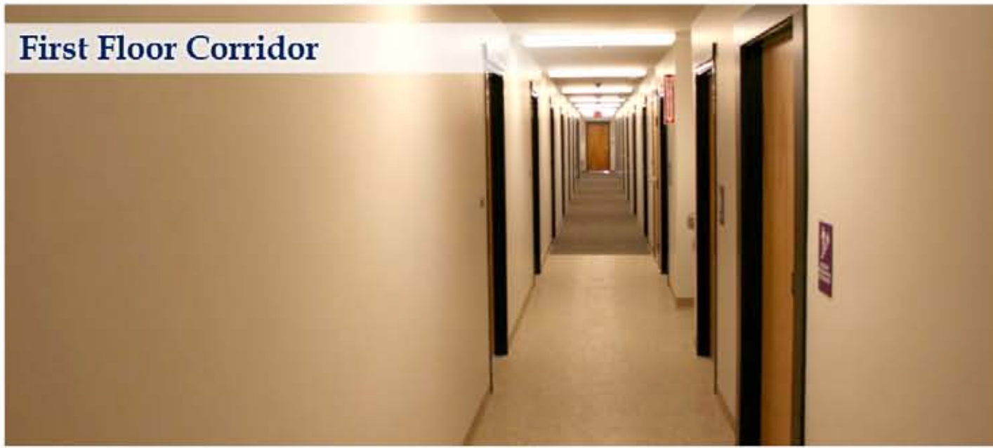
First Floor Corridor